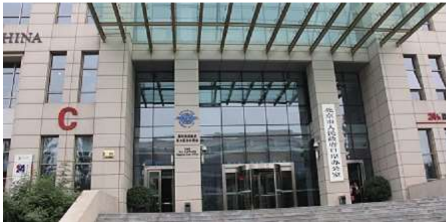
Entrance leading to APAC RSO